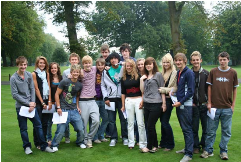
Ratcliffe College students enjoy their GCSE results!