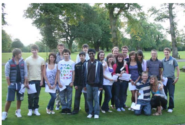
Happy Ratcliffe students celebrate their success!