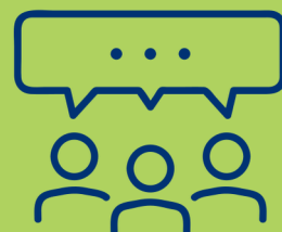
Heads of Year and Boarding