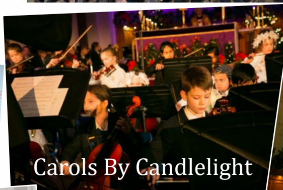
Carols By Candlelight