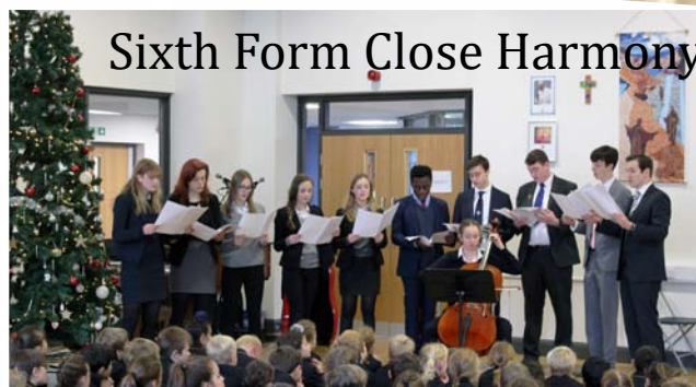
Sixth Form Close Harmony