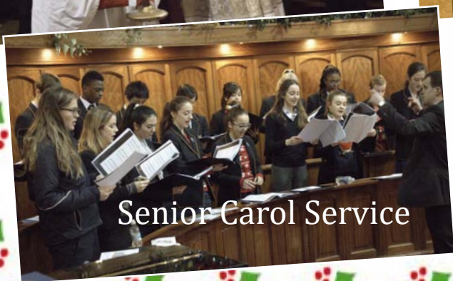
Senior Carol Service