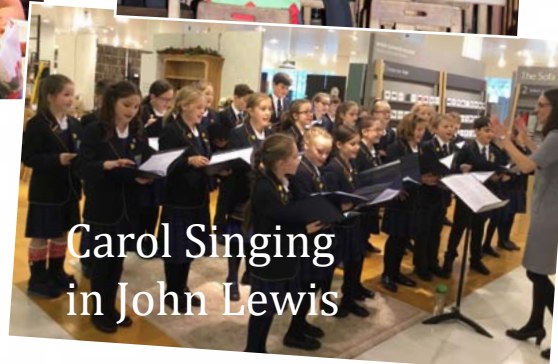
Carol Singing in John Lewis