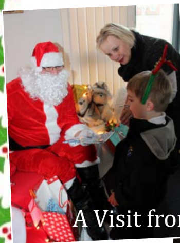
A Visit from Santa