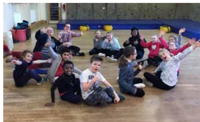
ACTIVITIES ON YEAR 5 RESIDENTIAL TRIP, ALTON CASTLE