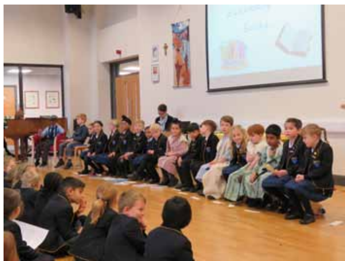
YEAR 2 ASSEMBLY TIME