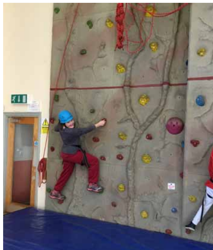
ACTIVITIES ON YEAR 5 RESIDENTIAL TRIP, ALTON CASTLE