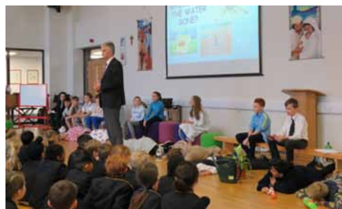
WHERE'S ALL THE WATER GONE?