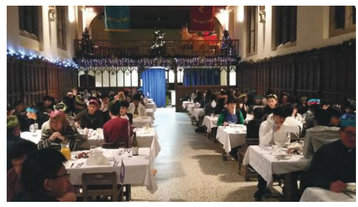
BOARDERS' ADVENT MEAL