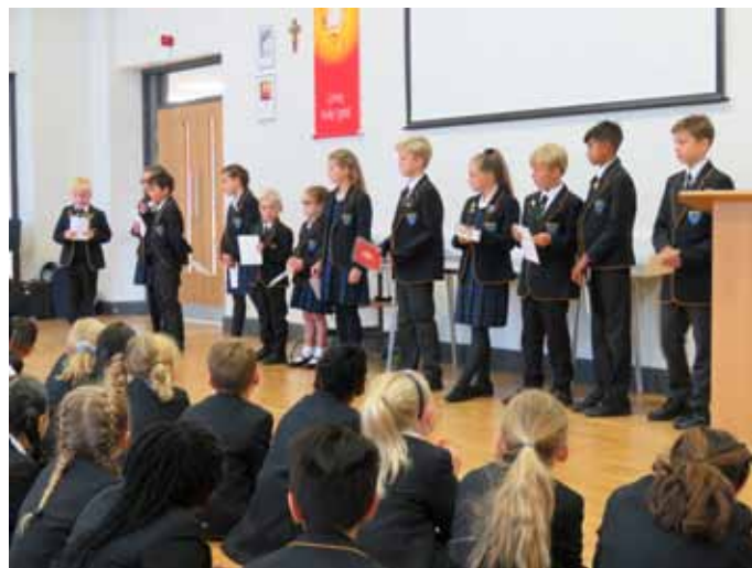
AWARD TIME DURING ASSEMBLY

Received a certificate for swimming 100 metres.