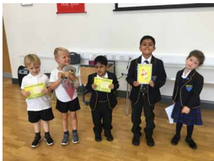
KEY STAGE I CELEBRATION