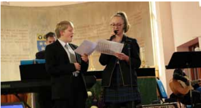
MUSIC & WORSHIP ASSEMBLY