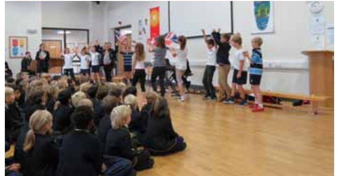
YEAR 6 ASSEMBLY