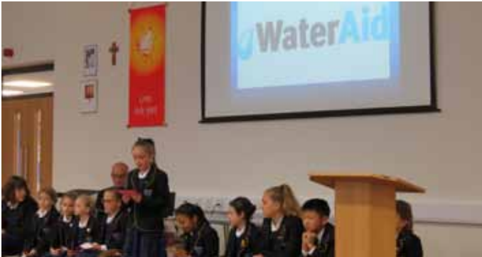
PREPARATORY SCHOOL ASSEMBLY