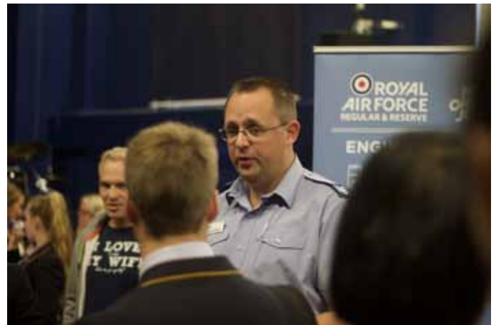
RATCLIFFE COLLEGE - CAREERS INSPIRE DAY