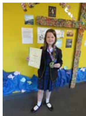
PREPARATORY SCHOOL ACHIEVEMENTS