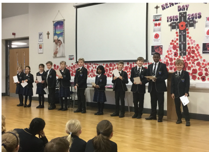
STUDENTS OF THE WEEK: 10TH JANUARY 2019