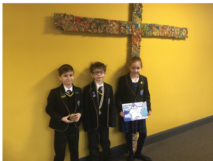
ACHIEVERS: 10TH JANUARY 2019