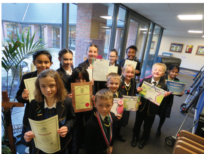
ACHIEVEMENTS: 17TH JANUARY 2019

Please click here to see the successes of our Preparatory children in the last fortnight.