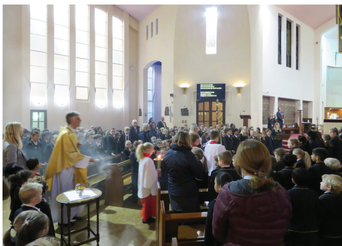
START OF SPRING TERM PREPARATORY SCHOOL MASS