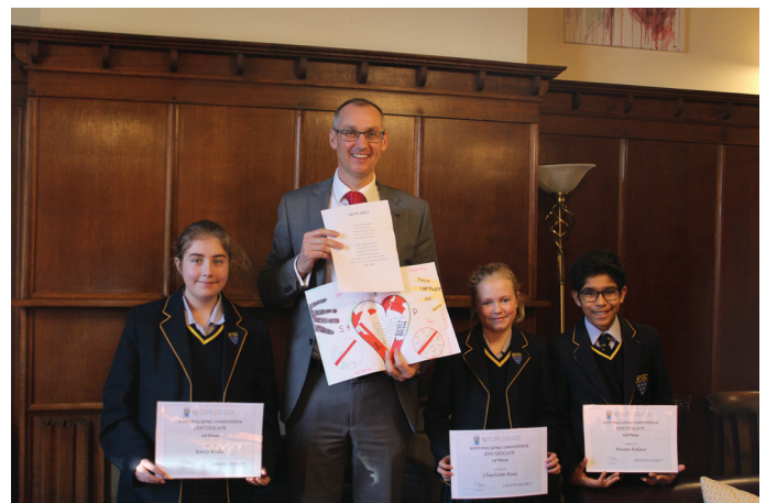
PSHCE:ANTI-BULLYING COMPETITION WINNERS