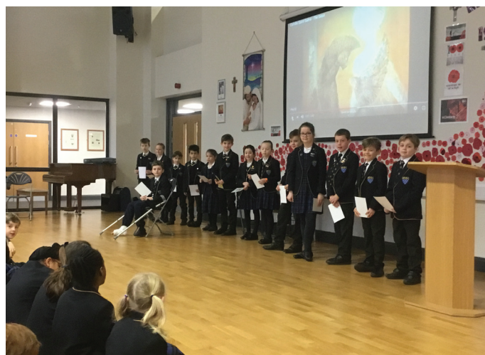
STUDENTS OF THE WEEK: 18TH JANUARY 2019