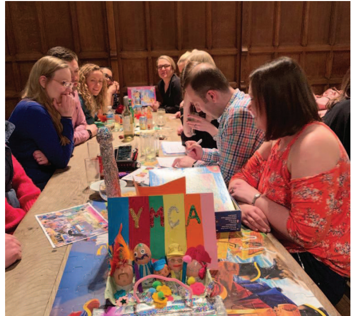
PARENTS' ASSOCIATION QUIZ AND CURRY WINNERS