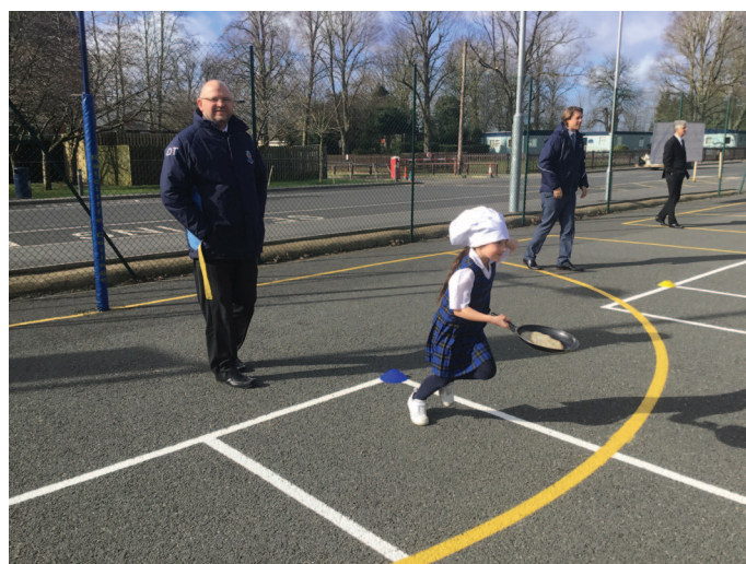
PANCAKE RACES: 5TH FEBRUARY 2019