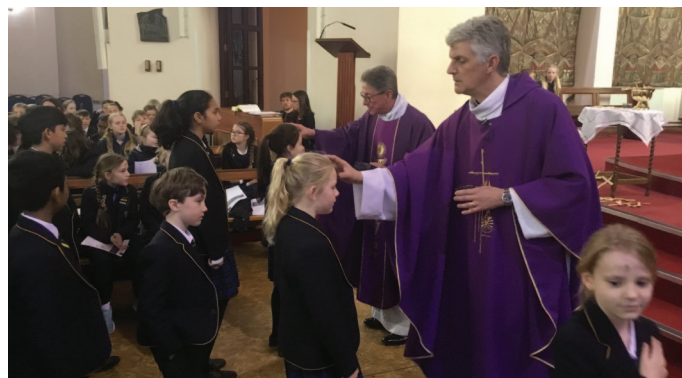
PREPARATORY SCHOOL ASH WEDNESDAY MASS