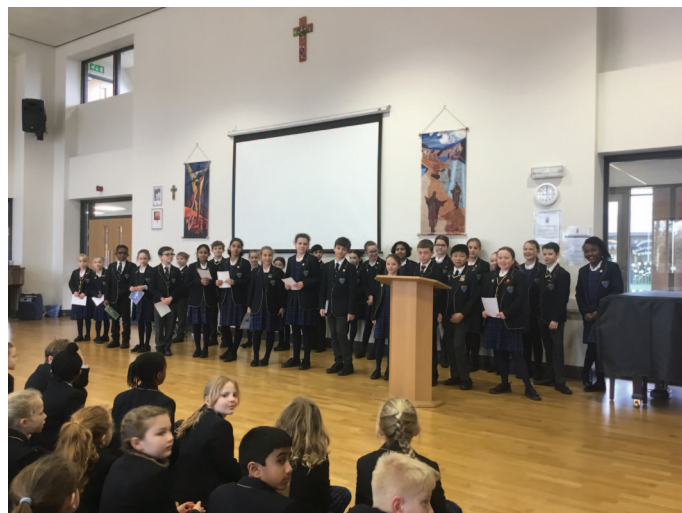
STUDENTS OF THE WEEK: 8TH MARCH 2019