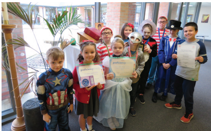
ACHIEVERS: 7TH MARCH 2019