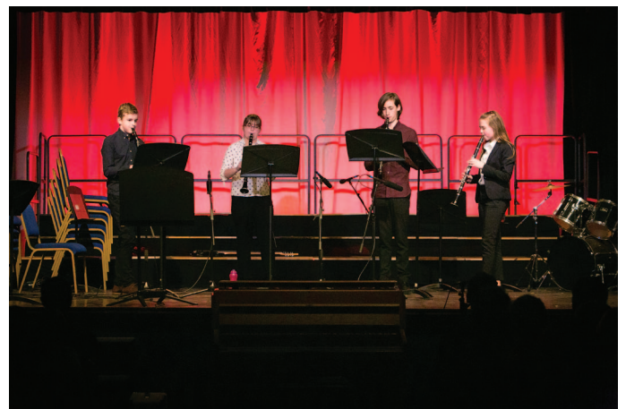
RATCLIFFE COLLEGE SPRING CONCERT 2019