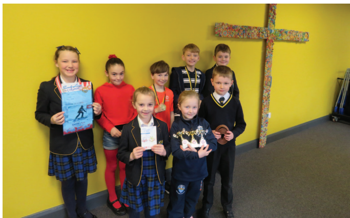
ACHIEVERS: 28TH FEBRUARY 2019