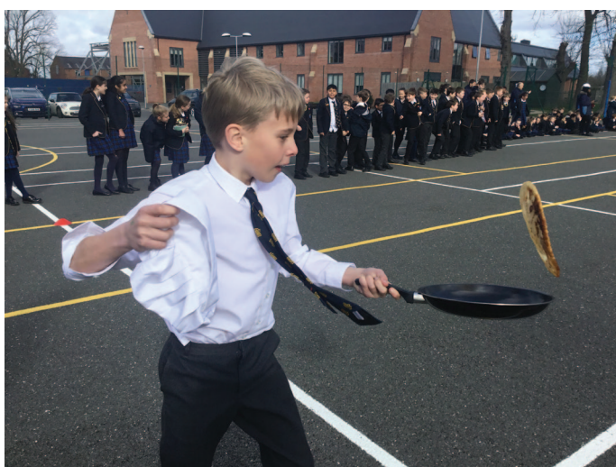
PANCAKE RACES: 5TH FEBRUARY 2019