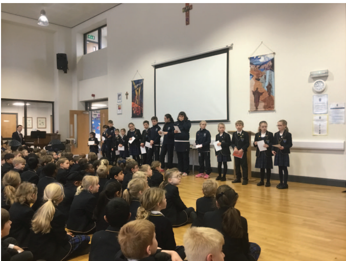
Students of the week: 22nd March 2019