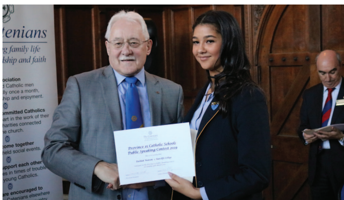
The Catenian Public Speaking Contest 2019