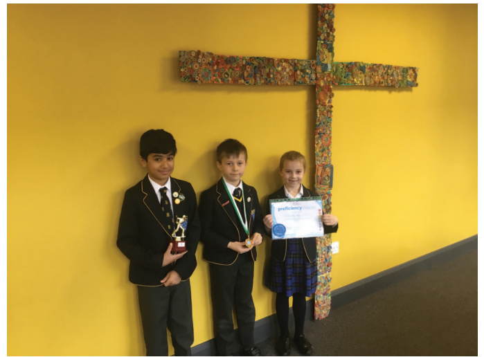
Achievers: 14th March 2019