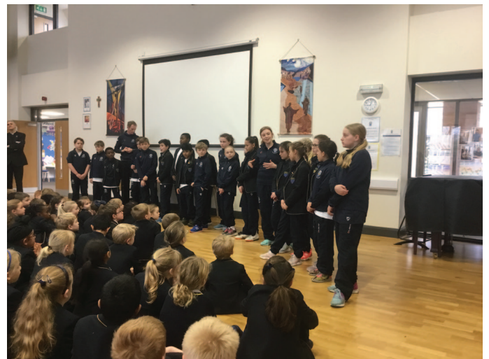
Under 11 Boys and Girls County Hockey Champions