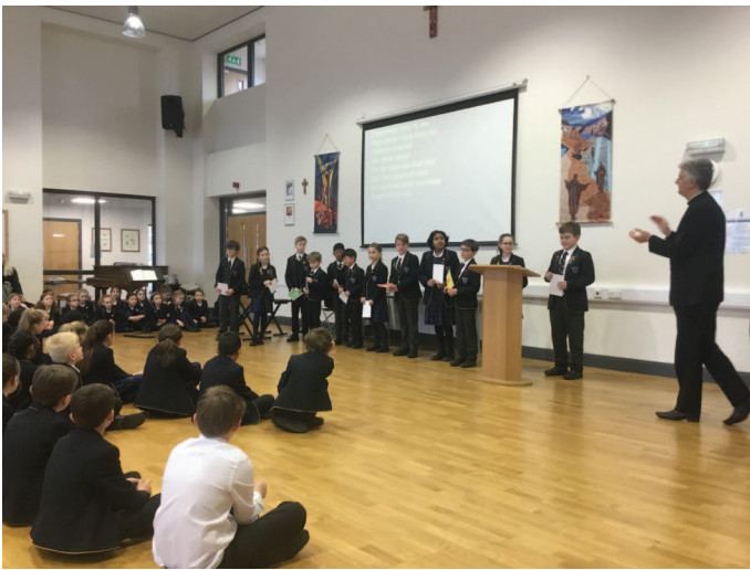
Students of the week: 15th March 2019

Please click here to see the successes of our Preparatory children in the last fortnight.