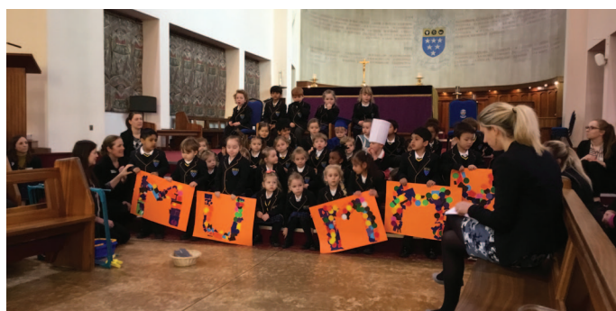
Preparatory School Mother's Day Mass