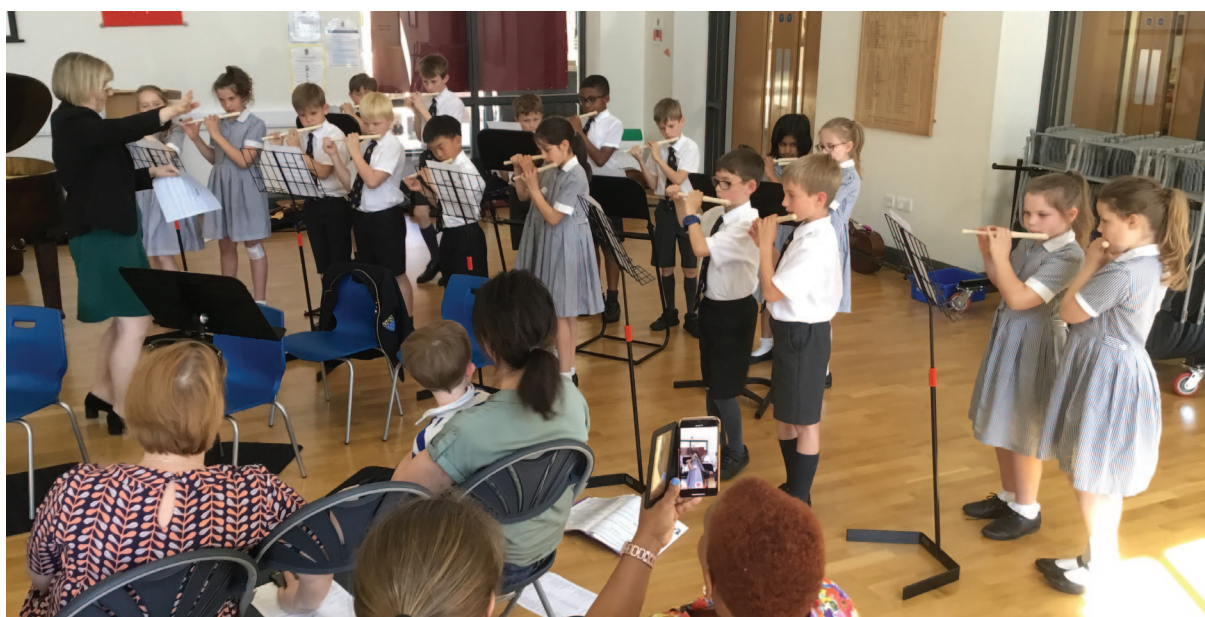
Year 4 Informal Concert - 14th May 2019

Please click here to see the successes of our Preparatory children in the last fortnight.