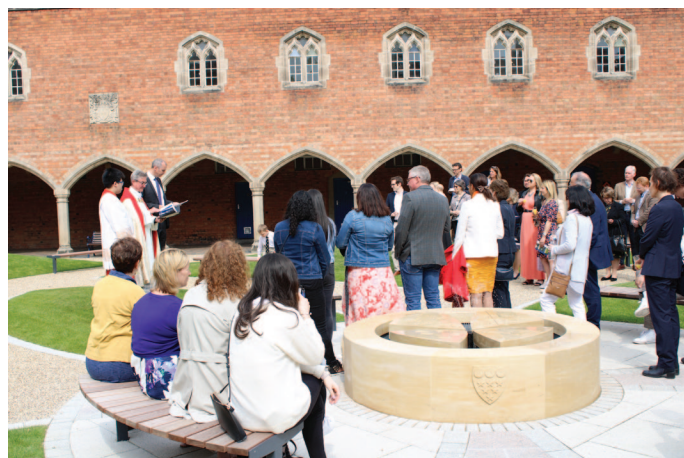
Official opening and blessing of the Lockhart Garden, Sunday 19th May