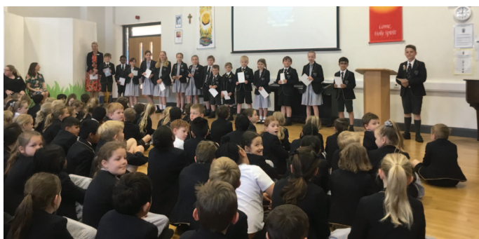
Pupils of the Week - 24th May 2019