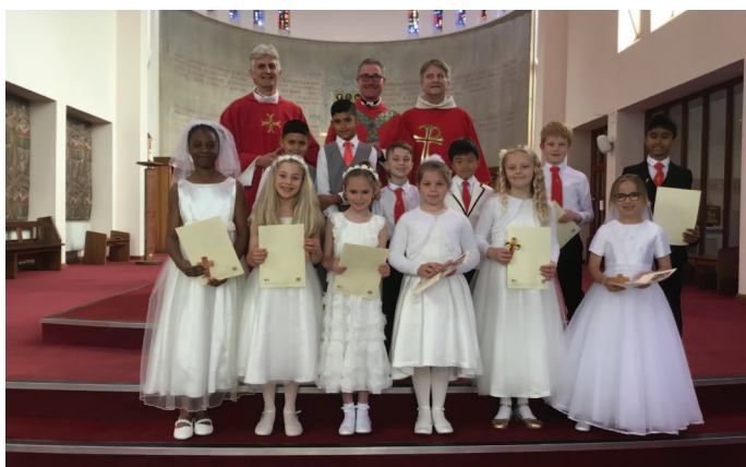
First Holy Communion