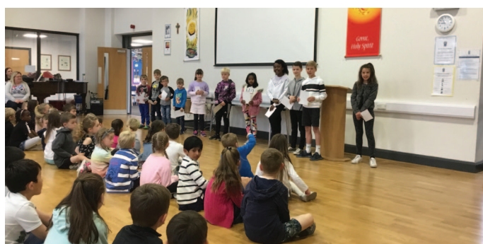
Pupils of the Week - 17th May 2019