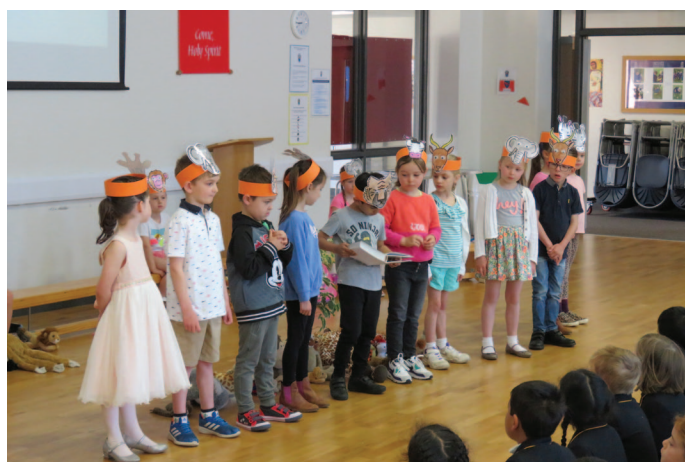
Year 1 Assembly - Animals facing extinction and how we can help them