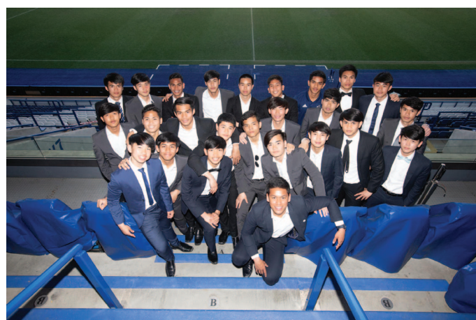
Pictured: Scholars, LCFC staff and Ratcliffe College staff; Award winners