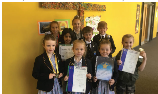
Achievers - 23rd May 2019