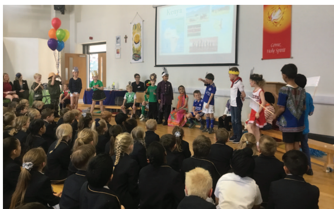
Year 2 Assembly - Diversity

Please click here to see the successes of our Preparatory children in the last fortnight.