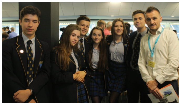
Ratcliffe College's Go4SET Teams

On Thursday 27th June 2019, 47 teams representing 21 schools from the East Midlands region attended the Go4SET Celebration and Assessment Day at Pride Park in Derby. This event concluded the Science and Engineering competition Go4SET, and Ratcliffe had two teams in the competition, each made up of students from Year 9. Both of our teams' projects were well received by the judges and other students in the competition. Indeed, one group made a particularly good impression, perhaps due to the inclusion of a working water wheel in their model that actually generated electricity! Click here to read more.