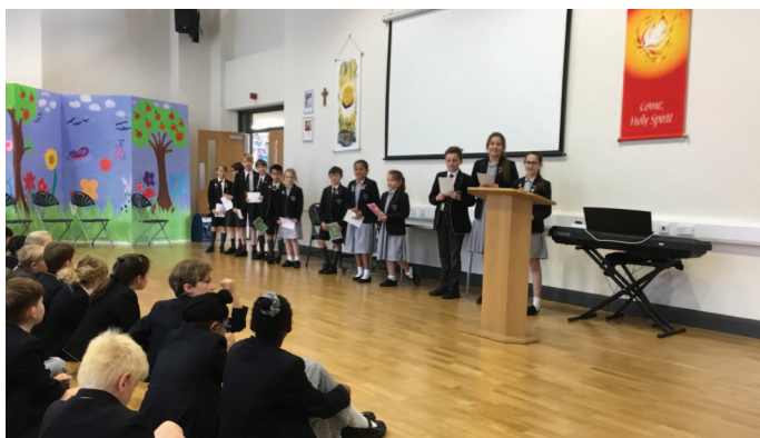
Pupils of the Week - 7th June 2019

Please click here to see the successes of our Preparatory children in the last fortnight.