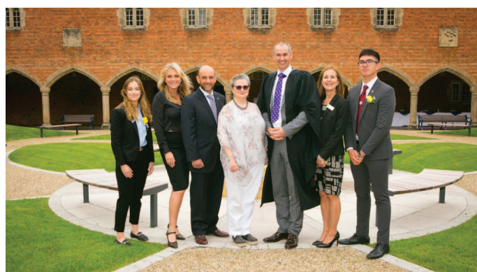
Ratcliffe College Exhibition Day: 26th June 2019