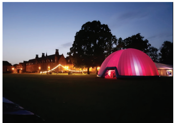
Ratcliffe College Sixth Form Ball