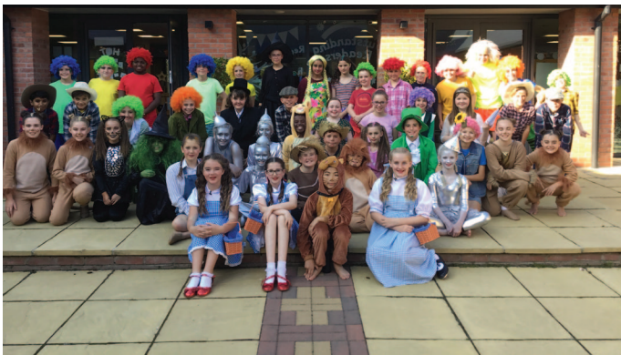
Year 6 - 'The Wizard of Oz'

The government has decided that the early 2020 May bank holiday will be moved back four days next year to coincide with the 75th anniversary of VE Day. Therefore, Ratcliffe College has amended the published term dates to coincide with this national change, moving the bank holiday from Monday 4th May to Friday 8th May. The amended date is also available on the School Website. Many thanks for your understanding.