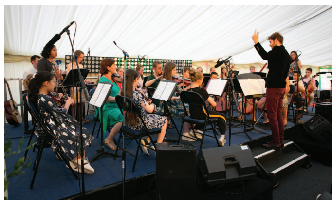
Picnic Concert - Newman Orchestra