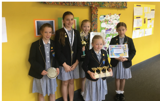
Achievers - 6th June 2019