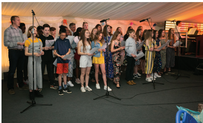
Ratcliffe College Picnic Concert