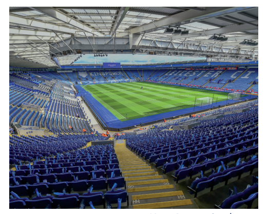
King Power Stadium