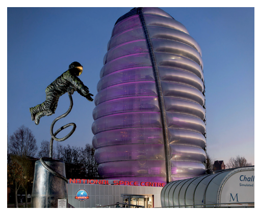
National Space Centre