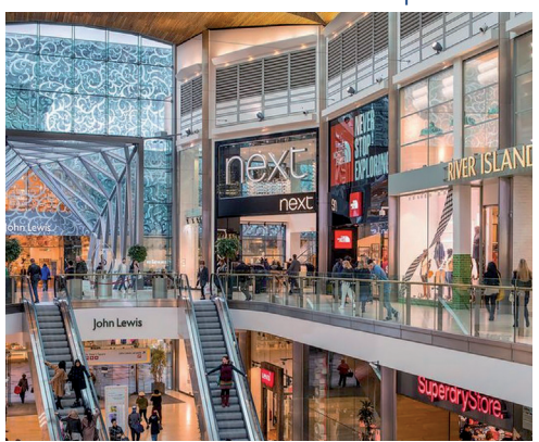
Highcross Shopping Centre