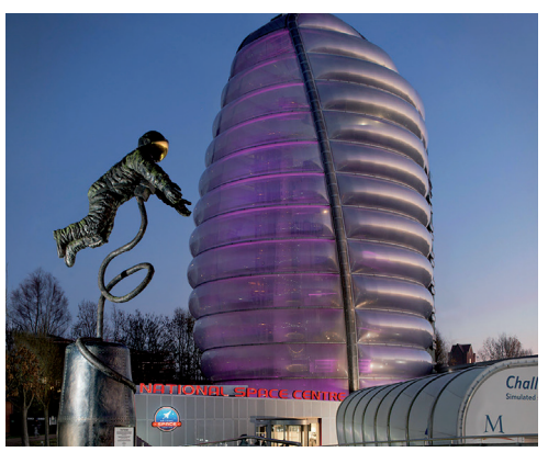
National Space Centre