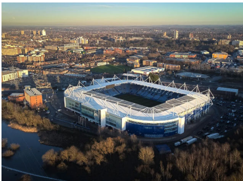
King Power Stadium Leicester