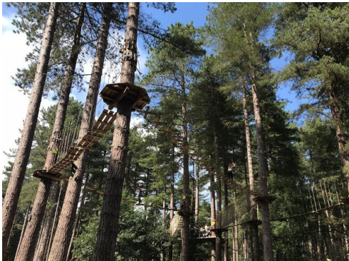
Go Ape, Sherwood Pines