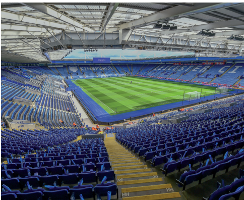
King Power Stadium