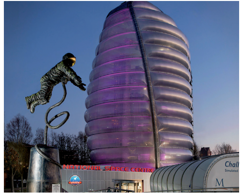
National Space Centre